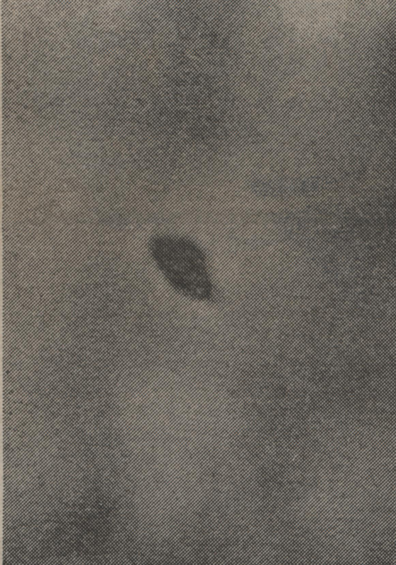
Perimeter of the "mother ship," thought to be 1200 feet wide.

Canon auto-zoom 10-14, using high-speed Ektachrome 160 film—and took pictures.