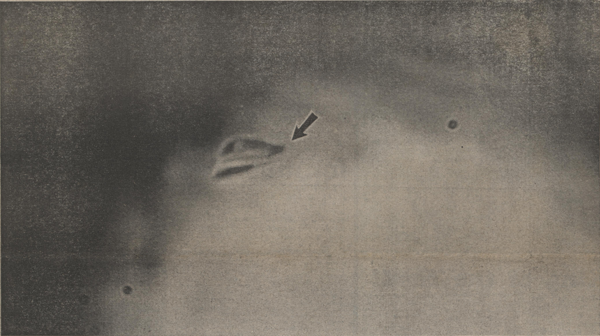
A small, saucer-shaped craft (arrowed) emerges from the top of the "mother ship"