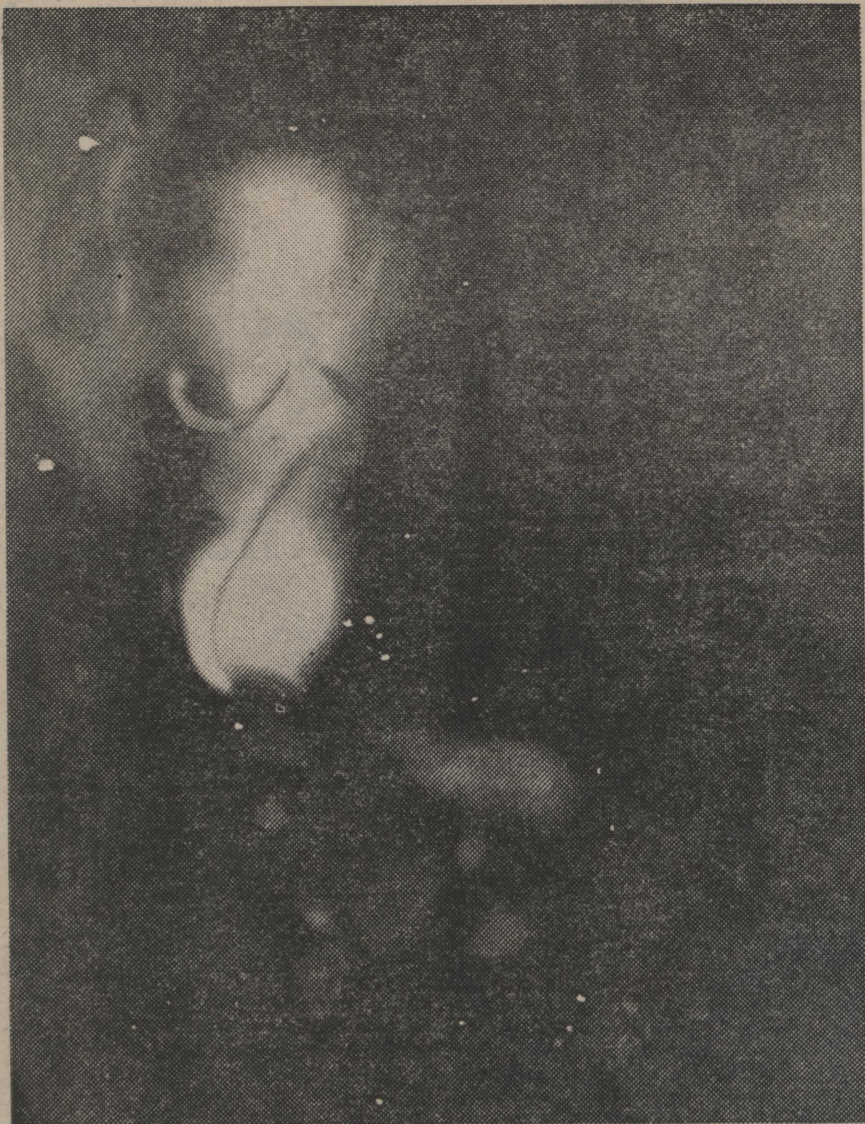
Enlarged outline of the creature described as a "humanoid"